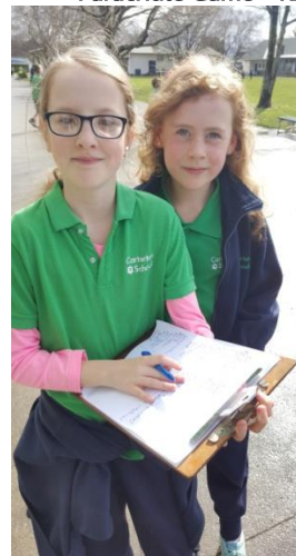
A library survey was being completed