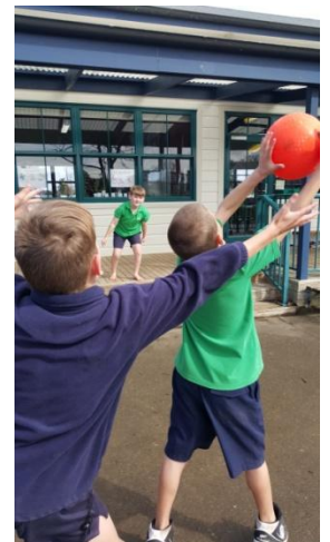
Active ball games