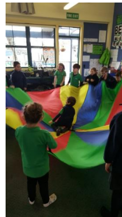
Parachute Game – Kiddy Kingdom