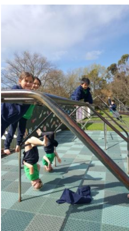
On the bars