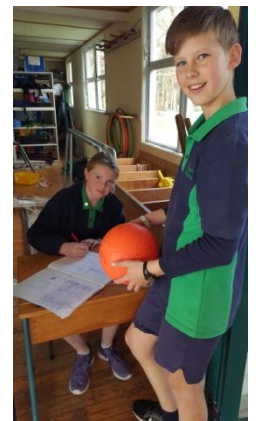
PE equipment shed